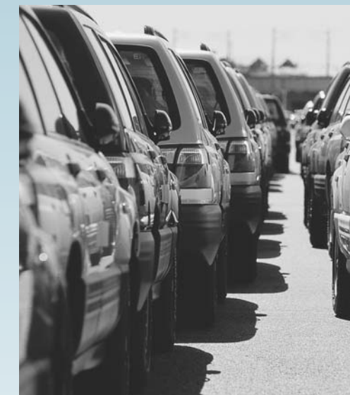
More than 60,000 vehicles were imported through Fremantle last year.

Processing the vehicles on the wharf provides savings in transportation costs and also adds value to the vehicles because they can be delivered directly to the dealer without the extra cost of transportation to Kewdale for processing.