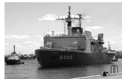
Japanese icebreaker, Shirase, is an annual visitor to Fremantle.

The Shirase is Japan's main Antarctic support vessel. A powerful icebreaker, it carries a post office on board and normally makes one single long voyage