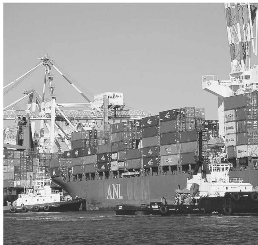
The container trade at Fremantle continues to grow strongly.

There have been no changes to public access to the western-end of Victoria Quay such as the ferry landings and the Maritime Museum.