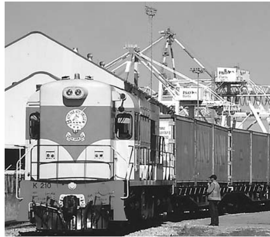
Construction of the North Quay rail loop is underway.

Work is underway on the construction of the new North Quay rail loop and stage 1 of the new rail terminal. The infrastructure will help to increase the use of rail for movement of container freight to and from Fremantle's Inner Harbour.