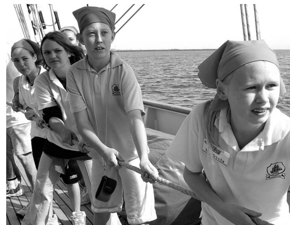
Students learn the ropes and a little about themselves aboard STS Leeuwin.

Eighty students from the Fremantle region learnt about their own capabilities and working with others on a Leeuwin Ocean Adventure day-sail sponsored by Fremantle Ports.