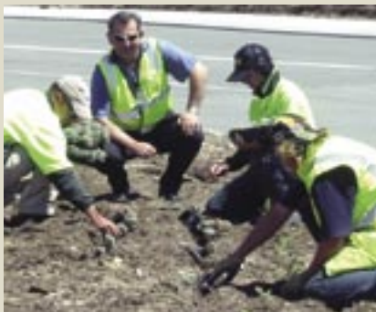
Planting begins along Tydeman Road.

The North Quay Rail Loop Landscaping Project is under way, reticulation pipe laying and planting having commenced at the new entrance to the Patrick container terminal.