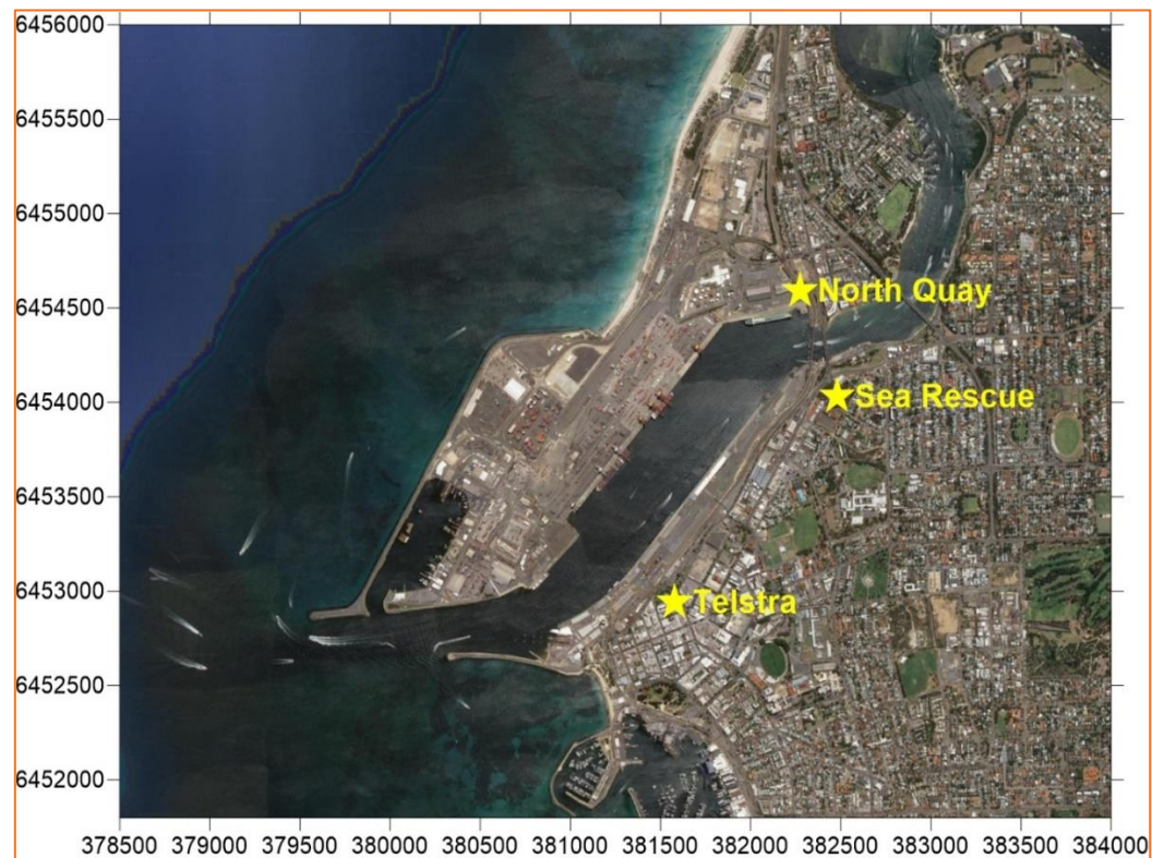
Figure 2: Monitoring locations within Fremantle