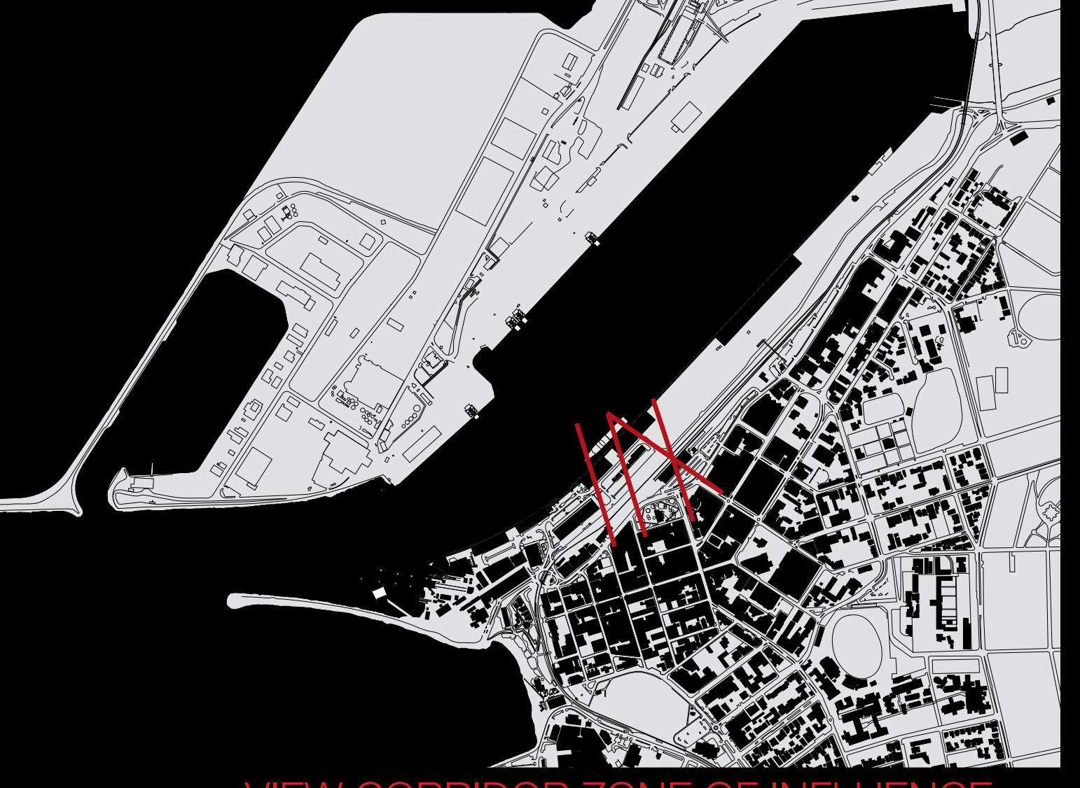
FW CORRIDOR ZONE OF INFLUENCE