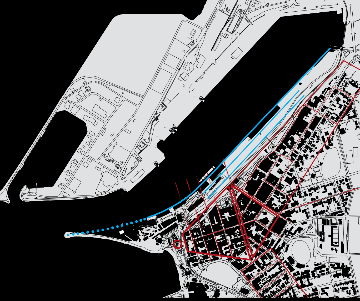
CITY AND PORT PATTERN