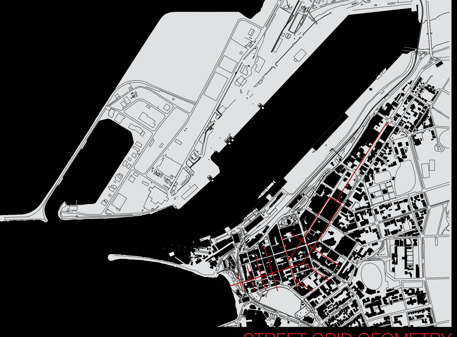
STREET GRID GEOMETRY