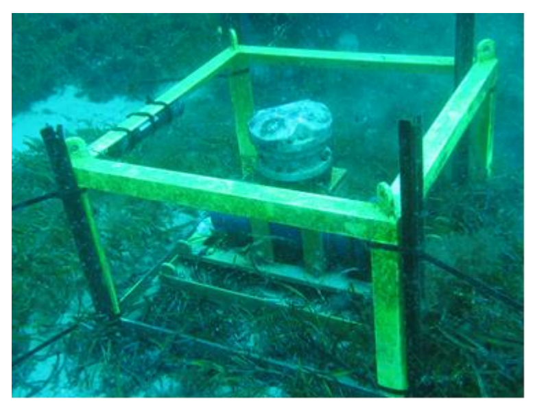
A typical AWAC. (1.0m x1.0m x0.5m high) frame secured to the seabed with star pickets and two anchors

Mariners are advised to navigate with caution when transiting the above area.