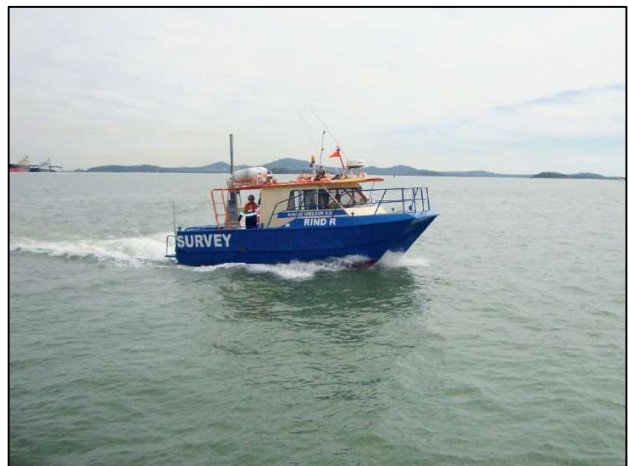
Hydrographic survey - RIND R