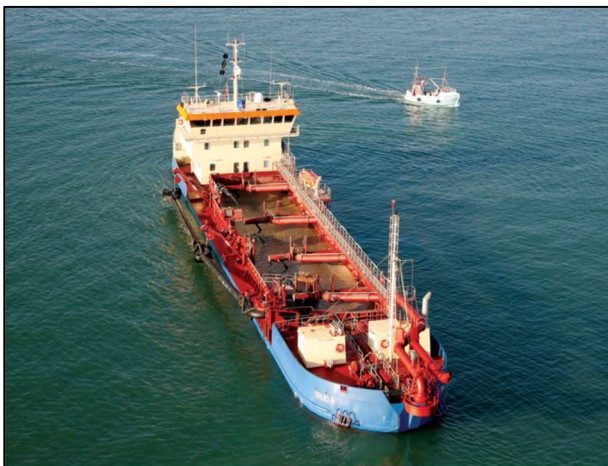
Dredge - TRUD R