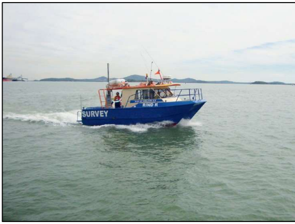
Hydrographic survey - RIND R