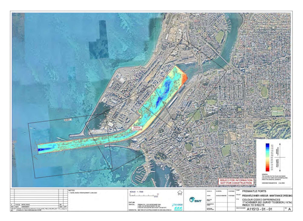
Inner Harbour Maintenance Dredging - 14.7m dredge area