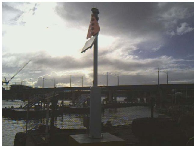
Wongara Shoal West Front