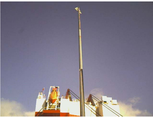
North Quay East (Berth #12) Front