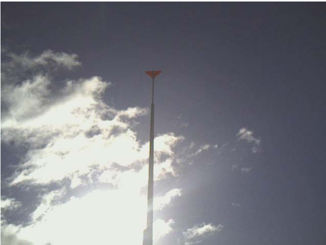
North Quay East (Berth #12) Rear