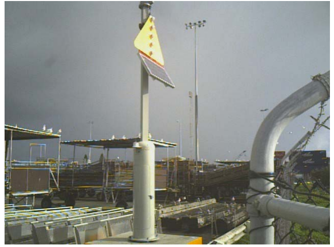
North Quay West (Berth #2) Front