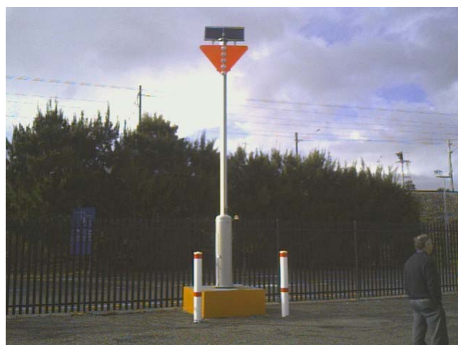
Wongara Shoal West Rear