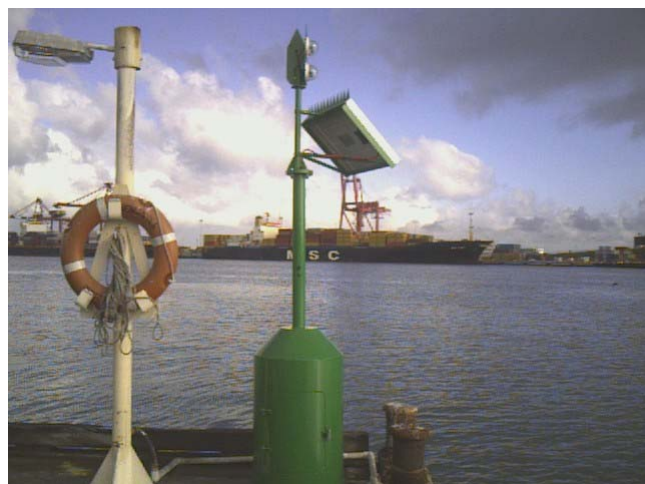
Victoria Quay (SCP) Starboard Lateral Mark