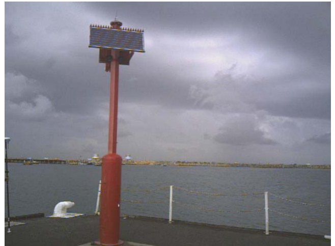
North Quay (Berth #1) Port Lateral Mark