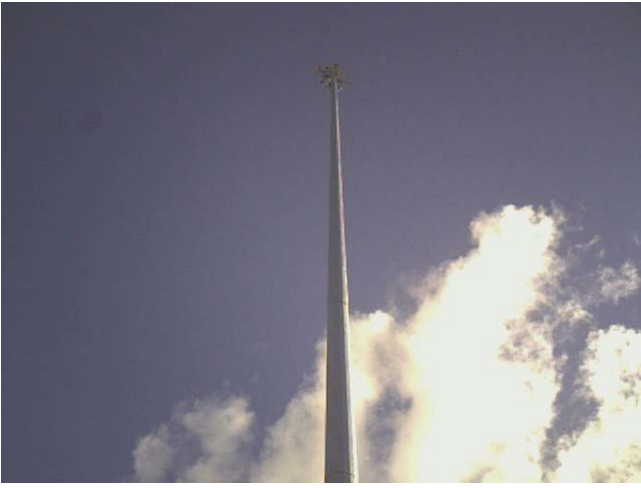
North Quay East (Old 12 Shed) 35m Pole Front