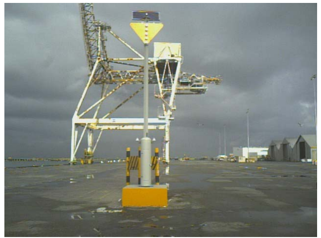
North Quay West (Berth #2) Rear