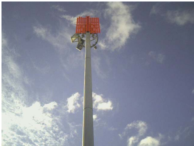
Inner Harbour Entrance Front