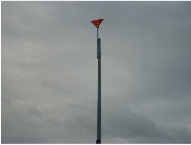
J Berth Rear