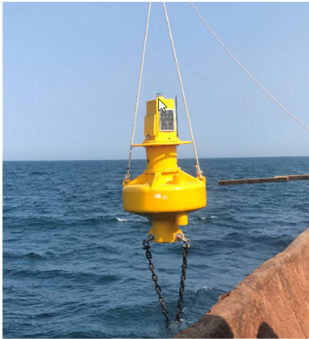
Figure 1: SB-138P Sentinel Buoy